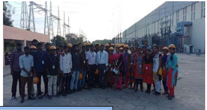
Industrial visit of “V.T.P.S” Vijayawada