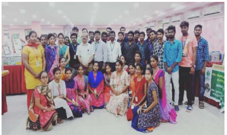
Industrial visit of Vizag steel plant, Vizag